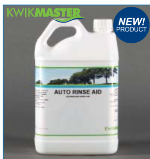
Kwikmaster Auto Rinse Aid