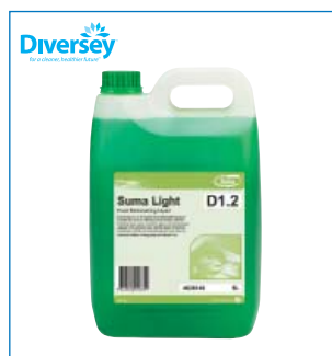
JohnsonDiversey Suma Light D1.2 Hand Dishwash