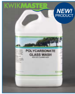
Kwikmaster Polycarbonate Glass Wash

CODE: KWGWP/5 CAPACITY: 2x5lt MIN. SELL: Ctn