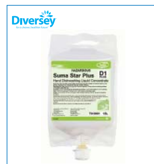
JohnsonDiversey Suma Star Plus D1 H/D/W Conc.