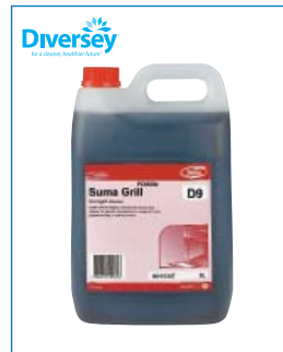
JohnsonDiversey Suma Grill D9 Oven & Grill Cleaner

CODE: JDHH15347 CAPACITY: 2x5lt MIN. SELL: Ctn