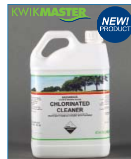
Kwikmaster Chlorinated Cleaner

CODE: KWCC/20 CAPACITY: 20lt MIN. SELL: Drum