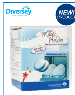
JohnsonDiversey Suma Magic Machine Ware Wash Tablets