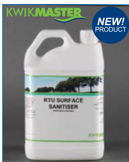
Kwikmaster Food Area Surface Sanitiser

CODE: KWFASS/5 CAPACITY: 2x5lt MIN. SELL: Ctn