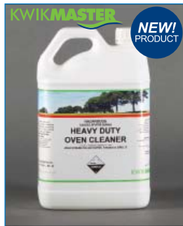
Kwikmaster Oven & Grill H/D

CODE CAPACITY MIN. SELL KWOGHD/20 20lt Drum KWOGHD/5 2x5lt Ctn