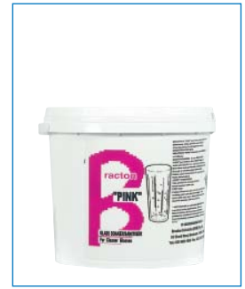
Bracton Pink Glass Soaker/Sanitiser

CODE CAPACITY BRABP002 10kg BRABP001 5kg