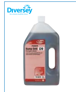
JohnsonDiversey Suma Grill D9 Oven Cleaner

CODE: JD730092 CAPACITY: 6x2lt MIN. SELL: Ctn