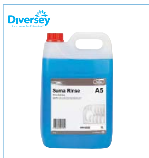
JohnsonDiversey Suma Rinse Aid A5