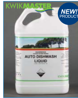
Kwikmaster Auto Dish Liquid

Talk to your local BCS Representative for more details.