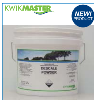
Kwikmaster Descale Powder