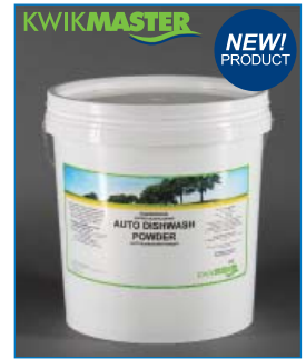
Kwikmaster Auto Dishwashing Powder