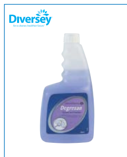
JohnsonDiversey Degresan Cleaner & Sanitiser

CODE: JDHH15525 CAPACITY: 750ml MIN. SELL: Each