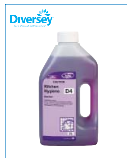
JohnsonDiversey Kitchen Hygiene D4 Sanitiser

CODE: JDHH14084 CAPACITY: 6x2lt MIN. SELL: Ctn