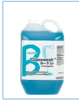
Bracton Ready-To-Use Glasswash

CODE CAPACITY MIN. SELL BRABG004 25lt Drum BRABG003 3 x 5lt Ctn