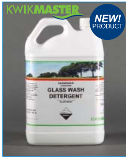
Kwikmaster Glass Wash Detergent

CODE: KWGWD/5 CAPACITY: 2x5lt MIN. SELL: Ctn