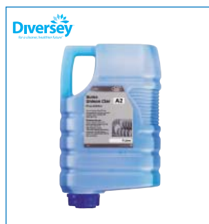
JohnsonDiversey Suma Unison Clar A2 Rinse Aid