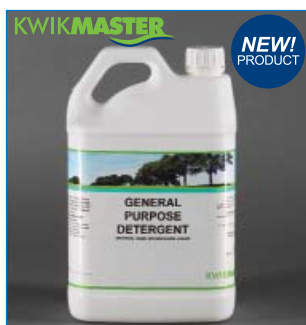
Kwikmaster General Purpose Detergent