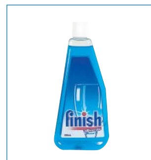
Finish Regular Rinse Aid