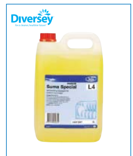
JohnsonDiversey Suma Special L4 D/W Detergent