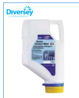
JohnsonDiversey Suma Unison Maxi G3 M/D/Wash