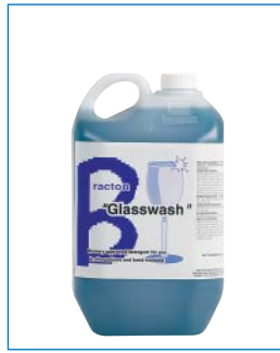
Bracton Concentrate Glasswash

CODE CAPACITY MIN. SELL BRABG002 25lt Drum BRABG001 3 x 5lt Ctn