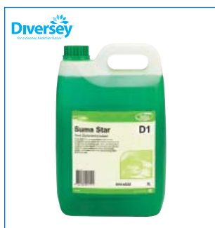
JohnsonDiversey Suma Star D1 Hand Dishwash Liquid