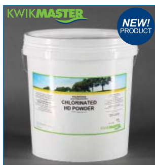
Kwikmaster Chlorinated H/D Powder