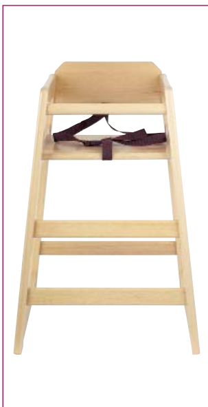
Utility High Chair

DECORATIVE BI-LEVEL RIDGE DESIGN COMPLIMENTS INDOOR ENTRANCES AND COMBATS THE HEAVIEST SOILED FOOT TRAFFIC. SUPERIOR WATER RETENTION QUALITIES. MOST SUITABLE ON TERRAZZO TIMBER AND VINYL FLOORS.