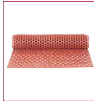
#555 Omnimat II

SIZE: 1500 x 914mm CODE COLOUR ZZ150 Terracotta Red ZZ151 Black