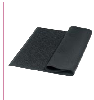
#625 Guardian Mat

CODE: ZZ311 SIZE: 1500 x 860mm COLOUR: Charcoal