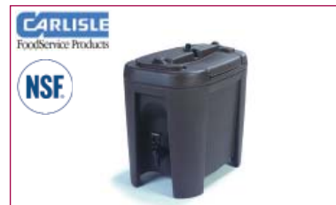
Carlisle Beverage Dispenser

FEATURES: Holds temperatures hours longer than traditional beverage servers. Unique lid seal provides for leak-proof transport