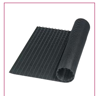
#390 Gripper Matting

IDEAL FOR USE IN WET AREAS SUCH AS BARS SHOWERS CHANGE ROOMS AND INDUSTRIAL APPLICATION. ANTIFATIGUE CUSHIONING COMFORT LIGHTWEIGHT AND EASILY CLEANED. RESISTANT TO BRINES ACIDS ALCOHOL ALKALI SOLVENTS AND CHLORINE.