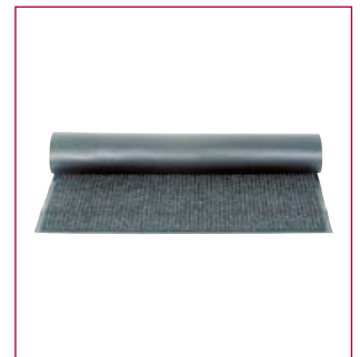
#620 Cobblestone Mat

100% POLYPROPYLENE RAISED SQUARE NUB SURFACE SUPPORTED BY REINFORCED RUBBER BACKING PREVENTS PILE FROM CRUSHING. HOLDS 6.76 LITRES OF WATER PER SQUARE METRE. EASILY CLEANED BY SWEEPING VACUUMING OR WETWASH