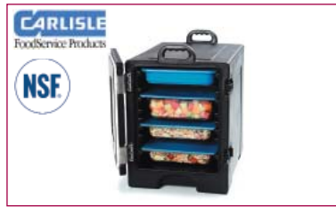
Carlisle Insulated End Loader

FEATURES: Insulated To Maintain Correct Serving Temperatures. Holds 8 Combinations Of 152mm 101mm And 63mm Deep Food Pans. Individual Track For Each Pan. Nylex Latches Eliminate Sharp Edges; Wont Rust Bend Or Dent