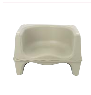
High Riser Child Seat

CODE: VPN250W COLOUR: White SIZE: L350 x W305 x H222mm