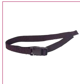
Waist Strap for Utility High Chair

CODE: ZZ152 SIZE: 914 x 914mm COLOUR: Black