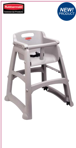
Rubbermaid Sturdy Chair without Wheels

CODE: RC781408PLAT COLOUR: Platinum SIZE: L59.7 x W59.7 x H75.6cm