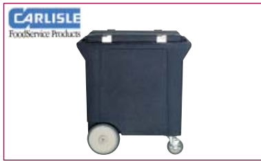
Carlisle Ice Caddy

FEATURES: Offers extra large capacity within a compact space. Lid opens and lays flat against side of unit to conserve space. Dual handles allow easy manoeuvrability. Includes drainage shelf. 254mm wheels 2 swivel casters (one with brake).