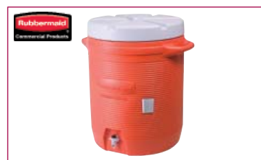
Rubbermaid Insulated Cold Beverage Container