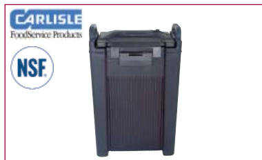
Carlisle Insulated XT Beverage Server

FEATURES: With sure-latch wide design latches which have three times the latch area of other beverage servers for a secure seal. XT lid design and improved O-ring seal eliminate leaks during transport; convenient pop-up vent.