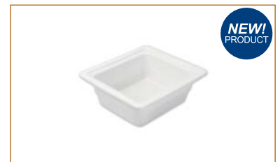
Gastronorm Food Pan 1/6 Size

CODE: TI921302 COLOUR: White MATERIAL: Porcelain LENGTH: 325mm WIDTH: 175mm HEIGHT: 65mm MIN. SELL: Each