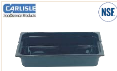
Carlisle Food Pan GN 1/1 Size

PATTERN: Top Notch COLOUR: Amber MATERIAL: Polysulfone MIN. SELL: Each