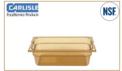
Carlisle Food Pan GN 1/3 Size

PATTERN: Top Notch COLOUR: Amber MATERIAL: Polysulfone MIN. SELL: Each