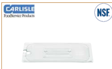
Carlisle Foodpan Handled Notched Lid GN

CODE: CAR1033007 PATTERN: Top Notch COLOUR: Clear MATERIAL: Polycarbonate SIZE: L171 x W108 x H25mm MIN. SELL: Each