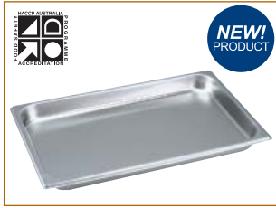
Gastronorm Pan 1/1 Size