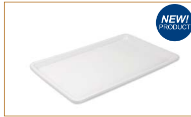
Gastronorm Food Pan 1/1 Size

CODE: TI921102 COLOUR: White MATERIAL: Porcelain LENGTH: 530mm WIDTH: 325mm HEIGHT: 65mm MIN. SELL: Each