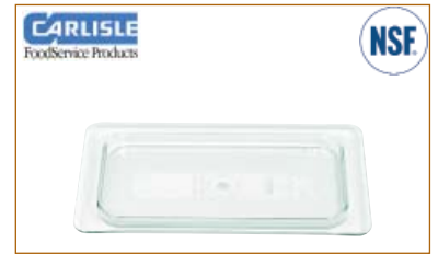
Carlisle Food Pan Lid GN 1/9 Size

PATTERN: Top Notch COLOUR: Clear MATERIAL: Polycarbonate MIN. SELL: Each