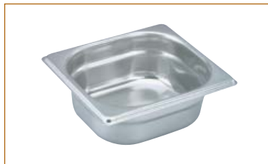
Maxipan-Gastronorm 1/6 Size

MATERIAL: Stainless Steel MIN. SELL: Each