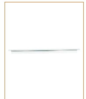
Adaptor Bar GN

MATERIAL: Stainless Steel MIN. SELL: Each