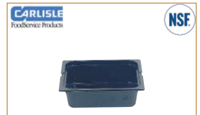
Carlisle Food Pan GN 1/2 Size