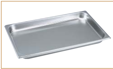
Maxipan-Gastronorm 1/1 Size