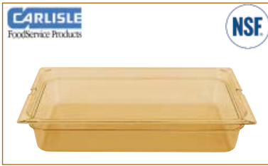
Carlisle Food Pan GN 1/1 Size