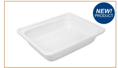
Gastronorm Food Pan 1/2 Size

CODE: TI921101 COLOUR: White MATERIAL: Porcelain LENGTH: 530mm WIDTH: 325mm HEIGHT: 25mm MIN. SELL: Each