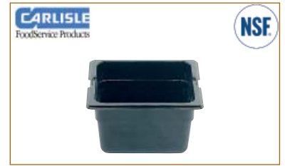
Carlisle Food Pan GN 1/6 Size