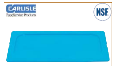
Carlisle Food Pan Smart Lid GN

PATTERN: Top Notch COLOUR: Clear MATERIAL: Polycarbonate MIN. SELL: Each