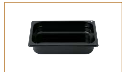
Maxipan Gastronorm Enamel 1/2 Size

CODE: TKME-11020 COLOUR: Black MATERIAL: Cast Iron LENGTH: 530mm WIDTH: 325mm HEIGHT: 20mm MIN. SELL: Each