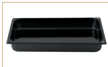
Maxipan Gastronorm Enamel 1/1 Size

CODE: TKME-11065 COLOUR: Black MATERIAL: Cast Iron LENGTH: 530mm WIDTH: 325mm HEIGHT: 65mm MIN. SELL: Each