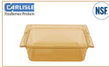
Carlisle Food Pan GN 1/2 Size

PATTERN: Top Notch COLOUR: Amber MATERIAL: Polysulfone MIN. SELL: Each