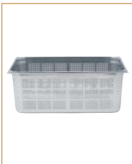
Maxipan-GN 1/1 Size Perforated

MATERIAL: Stainless Steel MIN. SELL: Each