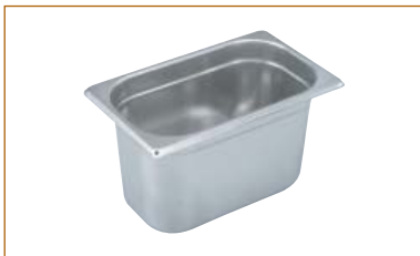
Maxipan-Gastronorm 1/4 Size

MATERIAL: Stainless Steel MIN. SELL: Each