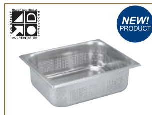
Gastronorm Pan Perforated 1/2 Size

HACCP APPROVED. 18/10 STAINLESS STEEL. MINIMUM GAUGE 0.6MM. ANTI-JAM DESIGN. REINFORCED EDGES ON PANS AND COVERS PROVIDE A SECURE FIT.