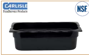
Carlisle Food Pan GN 1/3 Size