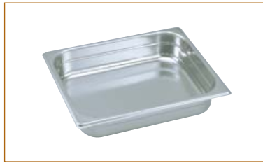
Maxipan-Gastronorm 1/2 Size

MATERIAL: Stainless Steel MIN. SELL: Each