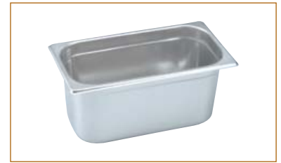
Maxipan-Gastronorm 1/3 Size

MATERIAL: Stainless Steel MIN. SELL: Each