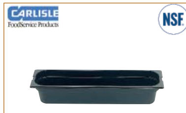
Carlisle Long Food Pan 1/2 Size