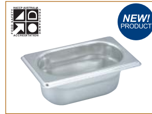
Gastronorm Pan 1/9 Size

HACCP APPROVED. 18/10 STAINLESS STEEL. MINIMUM GAUGE 0.6MM. ANTI-JAM DESIGN. REINFORCED EDGES ON PANS AND COVERS PROVIDE A SECURE FIT.