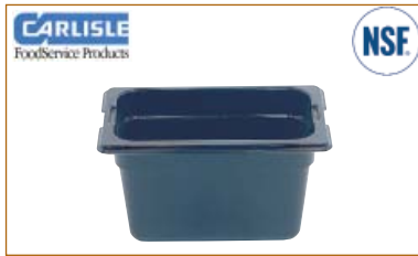
Carlisle Food Pan GN 1/9 Size