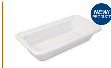
Gastronorm Food Pan 1/3 Size

CODE: TI921201 COLOUR: White MATERIAL: Porcelain LENGTH: 325mm WIDTH: 265mm HEIGHT: 25mm MIN. SELL: Each