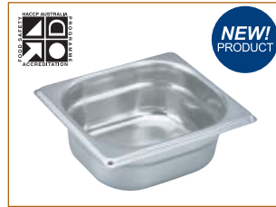
Gastronorm Pan 1/6 Size

HACCP APPROVED. 18/10 STAINLESS STEEL. MINIMUM GAUGE 0.6MM. ANTI-JAM DESIGN. REINFORCED EDGES ON PANS AND COVERS PROVIDE A SECURE FIT.