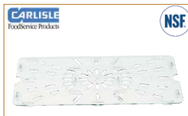
Carlisle Drain Shelf GN

PATTERN: Top Notch COLOUR: Clear MATERIAL: Polycarbonate MIN. SELL: Each