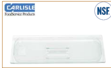
Carlisle Food Pan Handled Lid GN