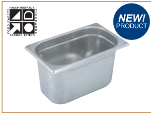
Gastronorm Pan 1/4 Size

HACCP APPROVED. 18/10 STAINLESS STEEL. MINIMUM GAUGE 0.6MM. ANTI-JAM DESIGN. REINFORCED EDGES ON PANS AND COVERS PROVIDE A SECURE FIT.