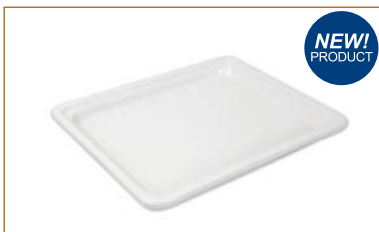
Gastronorm Food Pan 1/2 Size

CODE: TI921202 COLOUR: White MATERIAL: Porcelain LENGTH: 325mm WIDTH: 265mm HEIGHT: 65mm MIN. SELL: Each