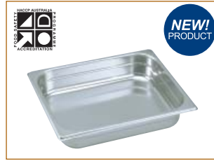
Gastronorm Pan 1/2 Size

HACCP APPROVED. 18/10 STAINLESS STEEL. MINIMUM GAUGE 0.6MM. ANTI-JAM DESIGN. REINFORCED EDGES ON PANS AND COVERS PROVIDE A SECURE FIT.