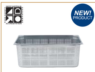
Gastronorm Pan Perforated 1/1 Size

HACCP APPROVED. 18/10 STAINLESS STEEL. MINIMUM GAUGE 0.6MM. ANTI-JAM DESIGN. REINFORCED EDGES ON PANS AND COVERS PROVIDE A SECURE FIT.