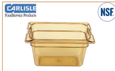
Carlisle Food Pan GN 1/6 Size

PATTERN: Top Notch COLOUR: Amber MATERIAL: Polysulfone MIN. SELL: Each