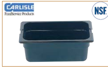
Carlisle Food Pan GN 1/4 Size