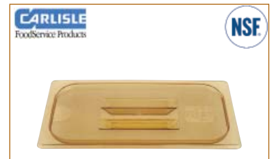
Carlisle Food Pan Handled Lid GN

PATTERN: Top Notch COLOUR: Amber MATERIAL: Polysulfone MIN. SELL: Each