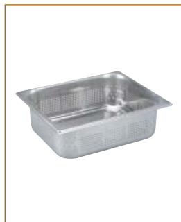
Maxipan-GN 1/2 Size Perforated

MATERIAL: Stainless Steel MIN. SELL: Each