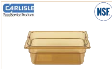
Carlisle Food Pan GN 1/4 Size

PATTERN: Top Notch COLOUR: Amber MATERIAL: Polysulfone MIN. SELL: Each