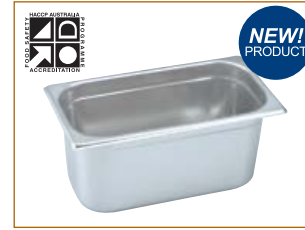
Gastronorm Pan 1/3 Size

HACCP APPROVED. 18/10 STAINLESS STEEL. MINIMUM GAUGE 0.6MM. ANTI-JAM DESIGN. REINFORCED EDGES ON PANS AND COVERS PROVIDE A SECURE FIT.