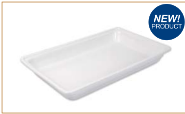
Gastronorm Food Pan 1/1 Size

CODE: TI921102 COLOUR: White MATERIAL: Porcelain LENGTH: 530mm WIDTH: 325mm HEIGHT: 65mm MIN. SELL: Each