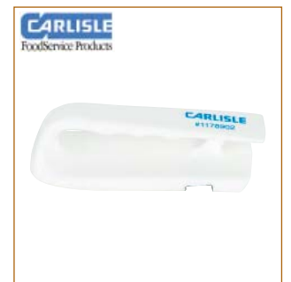
Carlisle Cutting Board Refinisher

CODE: CAR1180114 MATERIAL: Rubber COLOUR: Blue LENGTH: 330mm WIDTH: 457mm MIN. SELL: Each