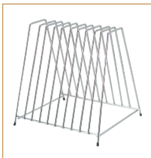
Cutting Board Rack 10 Slot

HACCP APPROVED CUTTING BOARDS. HYGIENIC TOUGH POLYPROPYLENE. COLOUR CODED FOR HYGIENIC FOOD PREPARATION. CERTIFIED FOR PROFESSIONAL FOOD SERVICE. HIGH CHEMICAL RESISTANCE. STAIN AND AROMA RESISTANT. WILL NOT CHIP, SPLINTER OR WARP. TEMPERATURE RANGE -20°C TO 105°C.