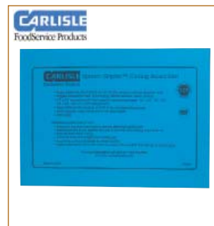
Carlisle Cutting Board Mat

CODE: CAR1180114 MATERIAL: Rubber COLOUR: Blue LENGTH: 330mm WIDTH: 457mm MIN. SELL: Each